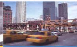
CLEAN AIR & COOL CITIES