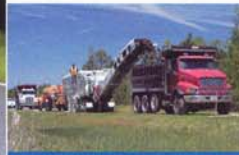
ENERGY & RECYCLING